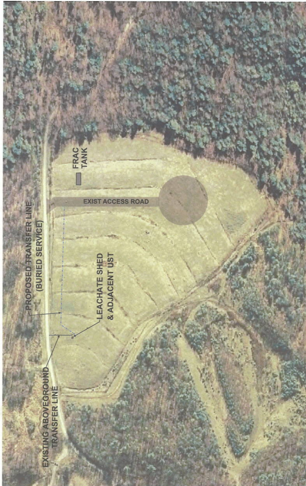
DEWEY LOEFFEL LANDFILL PROPOSED LEACHATE TRANSFER LINE UPGRADE